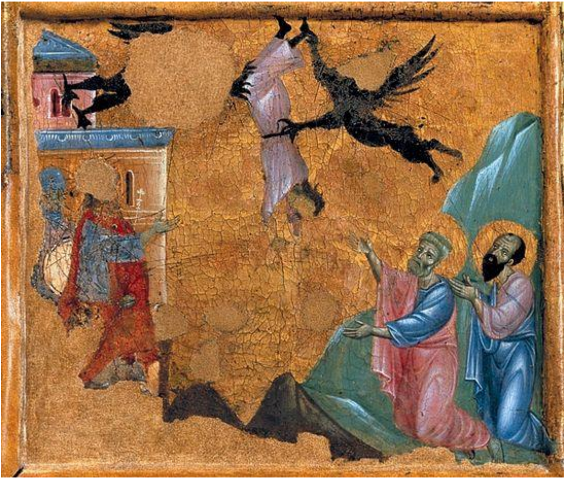
Rise and fall of Simon Magus from the Church of San Pietro in Banchi, in Siena, Italy

brilliant victory over the “spirit of Antichrist” ... and the Church of Christ, despite all the heavy trials it endured, was triumphant over its enemies.