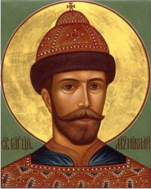
Royal Martyr Nicholas II – he who